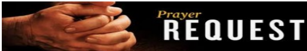
This is a prayer request and sick & shut in list (Hospital)

GoFundMe being the largest healthcare provider, school shootings and record-high disparities between CEO and worker pay are uniquely American problems amongst developed countries. The solutions already exist in the real world.