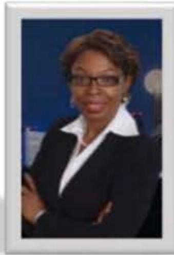
Judge Chika Anyiam Democratic judge-elect for the Dallas County Criminal District Court Texas No. 7