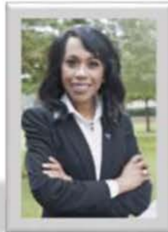
Judge Staci Williams Democratic judge of the Texas District Court 101