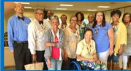
Sponsors and family supporting the new Hamilton Park Emmaus members